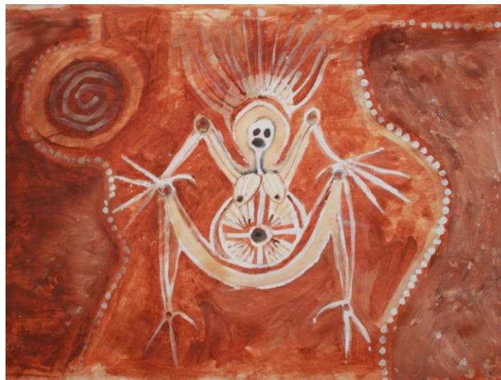
Figure 1. Gunalungalung Women's Business; Natural Ochre's on paper by Belanjee that illustrate the sacredness within cultural place and spiritual space. Location of cave not disclosed.

Classification by a Western interpretation of “art” devalues thousands of years of generational knowledge systems, where visual information has been respected, appreciated, and valued. This article attempts to create an alternative understanding of how the creative form within a cultural framework illustrates knowledge and therefore has little relevance to aesthetic pleasure in viewing, or acquirement within a sense of ownership, but reflects vital information based on living. For example, many symbols