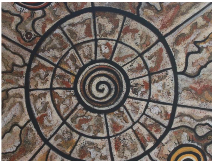
Figure 3. Visual knowledge of relationships to cultural place and spiritual space; Acrylic painting on canvas by Belanjee, illustrating concentric circles of cultural connections within place and radiating lines of the relationships within space.

One of the most common symbols used is the circle, which represents cosmological aspects of cultural place and spiritual space. Circular impressions left on rock surfaces also indicate forms of sacredness; expressions of connections to cultural place within mind, body, and emotions. Such evidence is witnessed within the many circular images engraved on rock surfaces within Dharug Country that often includes concentric circular forms that acknowledge the harmonies within the external and internal worlds. Western misinterpretations of some circular engravings within Dharug Country have been noted. For example, according to Sim (1996) these depictions represent the moon, or solar images, yet are actually knowledge of sacredness that contain ancestral power. These symbols contain a deep central engraved hole with three emitting circles built out from the central core, which contain up to twenty radiating lines. The first circle represents individual internal roots, such as intuition with the ancestral world, with the second, larger circle representing relationships to place and space. The third, outer circle relates to the close primary cultural connections such as totems, spiritual affiliations and the extended world. Radiating lines relate to all the relationships within personal place and space within a sense of timelessness.